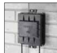
Wall Mount Application