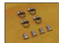
Hose Clamp Clip Kit