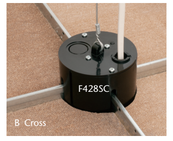
Attach drop wire to structural member. Install NM cable through installed NM connector. Reinstall ceiling tiles.

4 Install fan, fixture or other item per manufacturer's instructions.